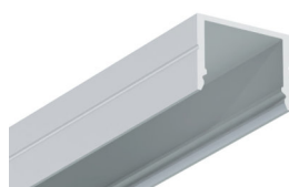
Aluminum Profile 85 LCPROF-85

To see the complete specifications of the featured aluminum profiles, visit the products page at: