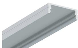
Aluminum Profile 84 LCPROF-84