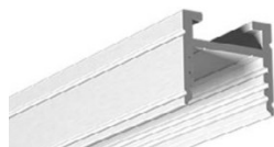
Aluminum Profile 14 LCPROF-14

To see the complete specifications of the featured aluminum profile, visit the product page at: