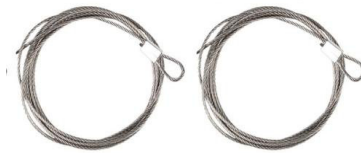
Suspensions Aircraft Cable (LCWRAPACC-SUSPENSION)