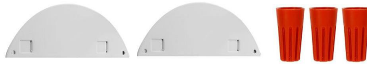
Surface Mount Kits (LCWRAPACC-CONNECTEUR)