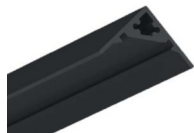
22BK - Profile, black