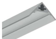
22 - Profile, alu