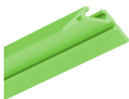
CU - Aluminum - Custom