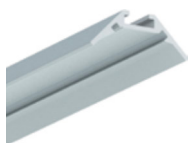
AL - Aluminum - Plain