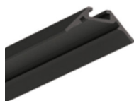
BK - Aluminum - Black