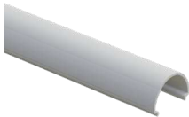
OP - Opaque