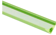
CU - Aluminum - Custom