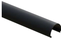
BK - Opaque - Black