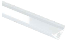
WH - Aluminum - White