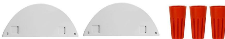
Surface Mount Kits (LCWRAPACC-CONNECTEUR)