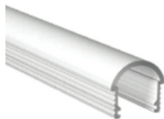
OPR - Opal round