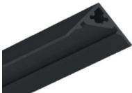
22BK - Profile, black