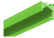
CU - Aluminum - Custom