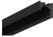
BK - Aluminum - Black