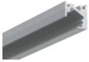
AL - Aluminum - Plain