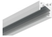
WH - Aluminium - White