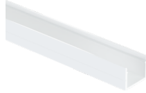
WH - Aluminum - White