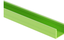
CU - Aluminum - Custom