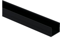
BK - Aluminum - Black