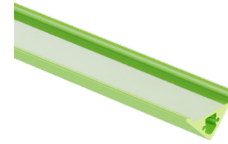
CU - Aluminum - Custom