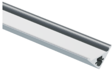
AL - Aluminum - Plain