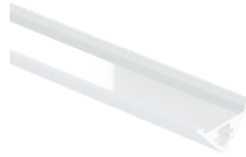
WH - Aluminum - White