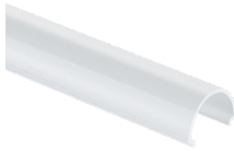
OP - Opaque