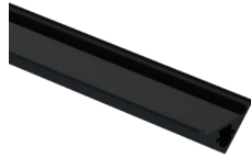
BK - Aluminum - Black